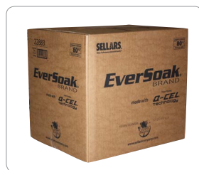
Basic Pads Outer Case