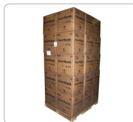
Basic Pads Outer Case on a Pallet

To order, contact your Authorized Sellars® Distributor